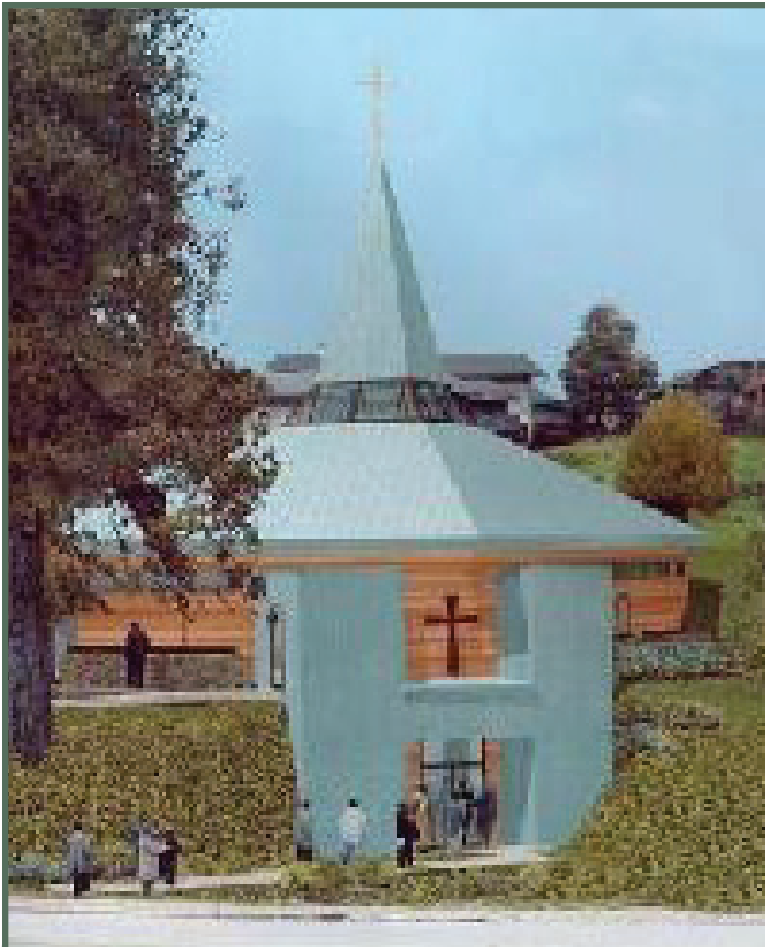
A rendering of the new Village Baptist Church, Marin City. It was completely gutted by a devastating fire.